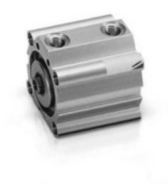
Description DF-381 Air Cylinder

Pneumatic air cylinder with guides manufactured in the external profile parallel to the sliding axis on three sides. These are used to locate the switches that sense the piston position. The non rotating guides make this pneumatic cylinder suitable for specific applications.